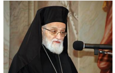
Patriarch Gregorios III

The Greek Catholic Patriarch Gregorios III reminded listeners in Münster that the border with Israel and half a million refugees who have fled into the country link Syria inextricably with the peace process.