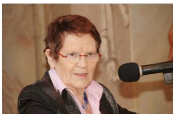
Prof. Rita Süßmuth

He also expressed his conviction that Syria stood to gain as hugely from cooperation with Europe as Europe did itself. He emphasized that peace could only be reached in the Middle East if all countries were involved and participated actively in the process, and that Syria itself had a key role to play. For this reason Syria could and should make a constructive contribution to the peace process. In this context, he welcomed the Initiative's Symposium as providing "outstanding support".